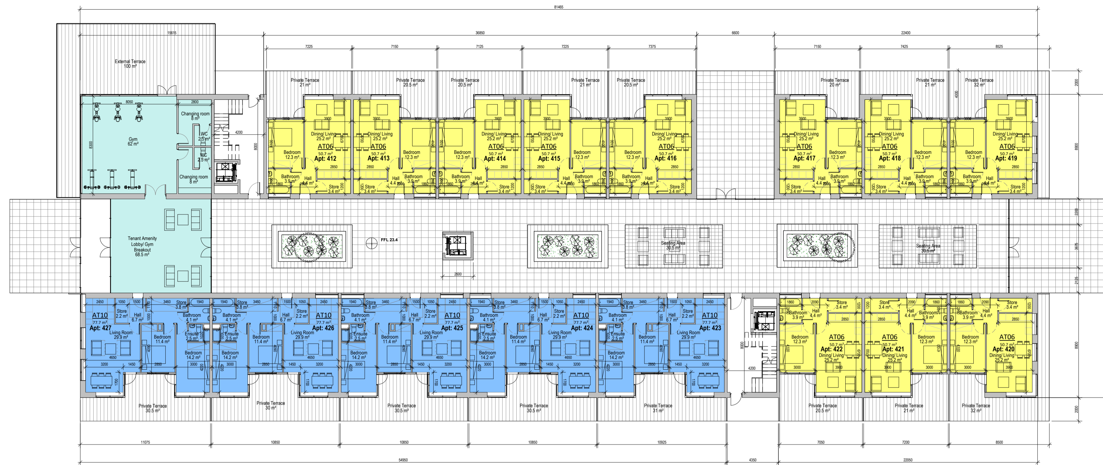
1 BLOCK 06 - Level 00 1 : 200